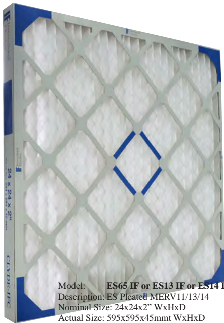
Model: ES65 IF or ES13 IF or ES14 IF Description: ES Pleated MERV11/13/14 Nominal Size: 24x24x2" WxHxD Actual Size: 595x595x45mmt WxHxD Thickness available 1" 2" 4"

ES Pleated Disposable is of extended surface and fully disposable. They can be used as primary / prefilters/Secondary filters in Fan Coil Units (FCU), Air Handling Units (AHU) or Fresh Air Fans (FAF), Cassette FCU in both new or existing air filtration system. The flat media pad can also be used as filter in split units to prevent dust build up in the coils. The pleated filter has greater extended surface allowing higher dust holding capacity and longer replacement intervals compared to flat panel filters. It is used as a pre-filter which considerably extends the life of other secondary filters in the filtration system. The higher efficiency filter greatly prevents dust build-up on heating and cooling coils, fans and duct. Reduced Coil cleaning frequency and inenergy savings.